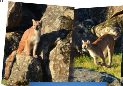
Yes, photographers are inside the fence with seldom a fence in your picture.