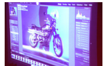
A series of stills taken while the light was moving over all parts of the bike with other shutters open.