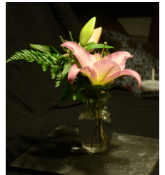
Same flowers, a different controlled lighting technique at each of four stations.