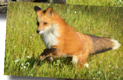
How close were we? That's my shadow in front of Baron the fox!