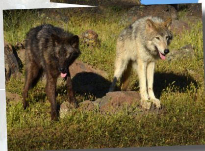
The wolves knew to "sit" and "stay" on command.