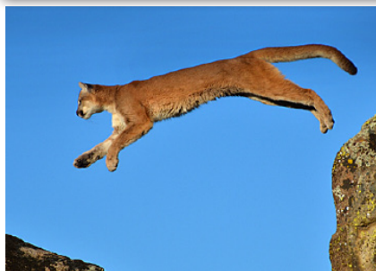
The jumping-cougar is the Tripple D signature shot.