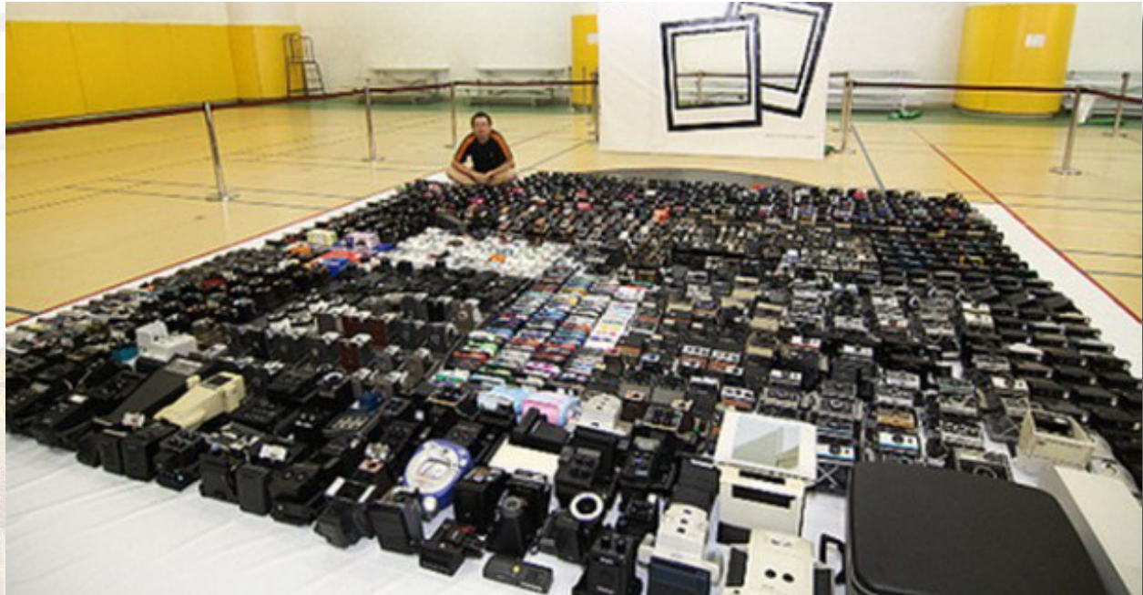
Certified as world's largest collection of antique cameras.