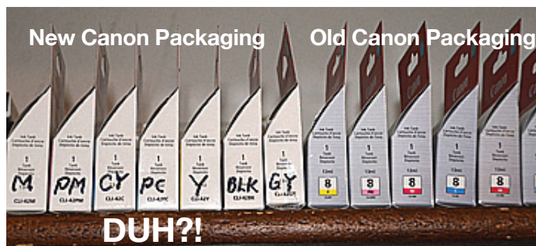
New inconvenient ink packages have to be marked by hand for easy ID when stored on your backup shelf. Colors are still printed on the front. DUH?!

Contrary to the name, Rapid Refills said they probably wouldn't have any of their third-party refilled carts for either printer for at least six months or maybe longer. Prices at this time are unknown.