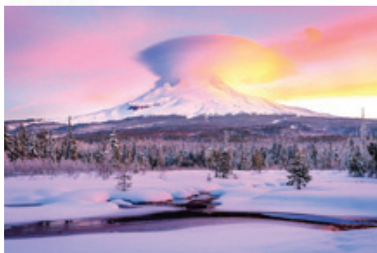
Mount Hood Wilderness Area, OR