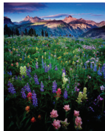
Grand Teton National Park, WY