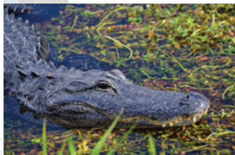
Marjory Stoneman Douglas, Florida