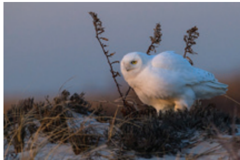
Otis Pike Fire Island Wilderness Area, NY