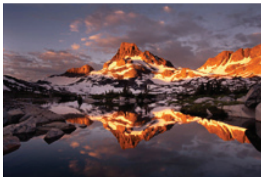
Banner Peak, Sierra Range, CA