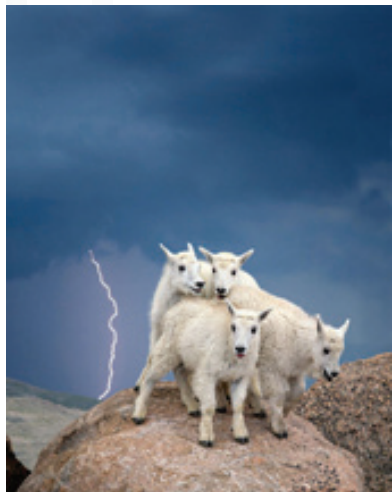
Mt. Evans Wilderness Area, CO