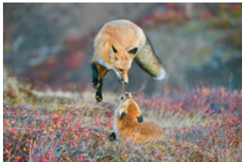
Denali National Park, AK