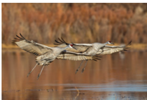
Bosque Del Apache, National WR, NM