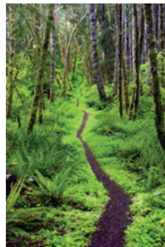
Aurora Ridge Trail, Sol Duc Valley, WA