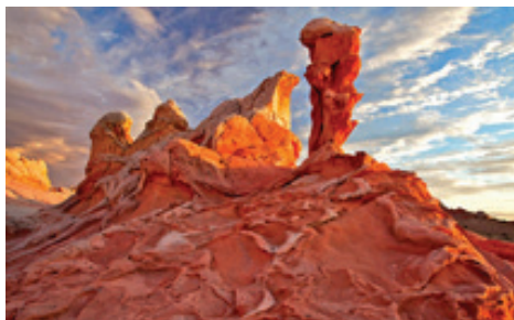
White Pocket, Paria Canyon, Vermillion Cliffs, Arizona