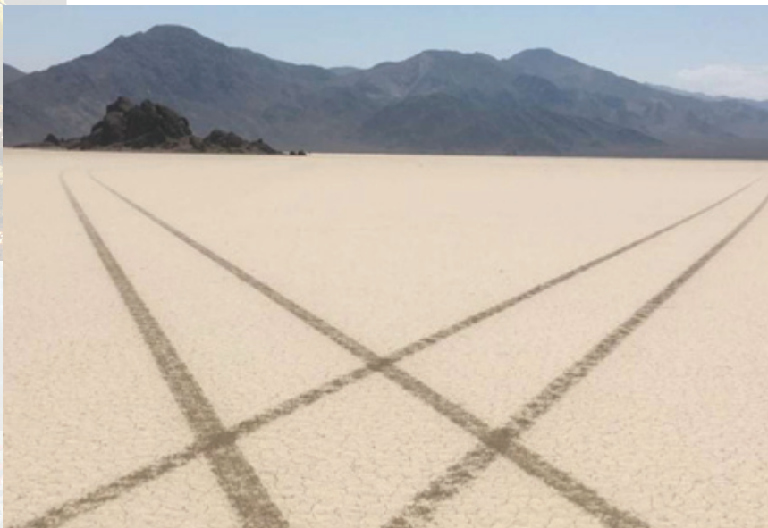
Average annual rainfall in Death Valley is 1.97 inches.

For those who have been here, we only hope that a lot of rain and some wind and ice under the sliding rocks will eventually erase these idiot tracks.