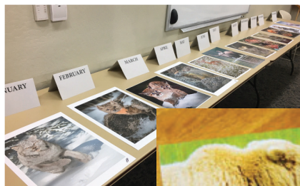
Judges final picks

There are still a few copies left, so if you'd like one or need more speak soon or they'll be all gone by the time to hang them on the wall for the coming year. Seven bucks each FCFS.