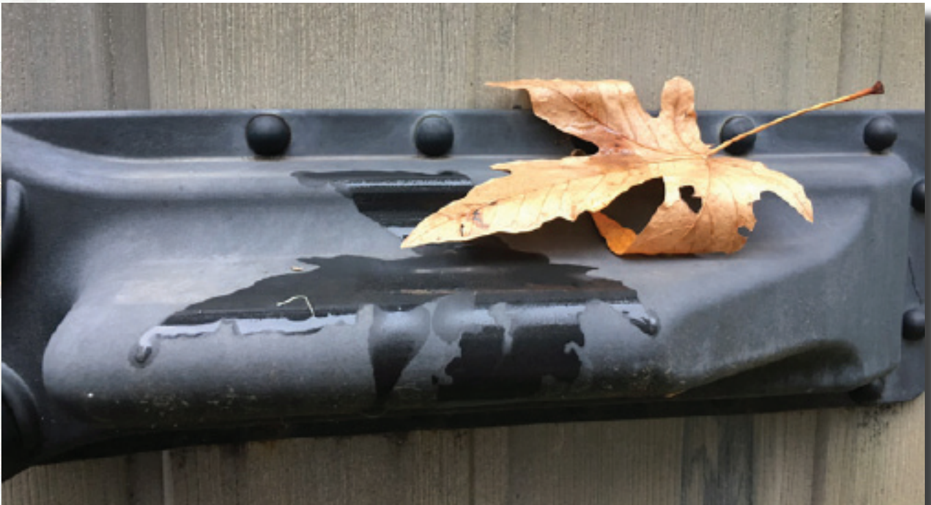
“Wet Negative” by Ron Green

(iPhone 6s – minor Snapseed post processing)