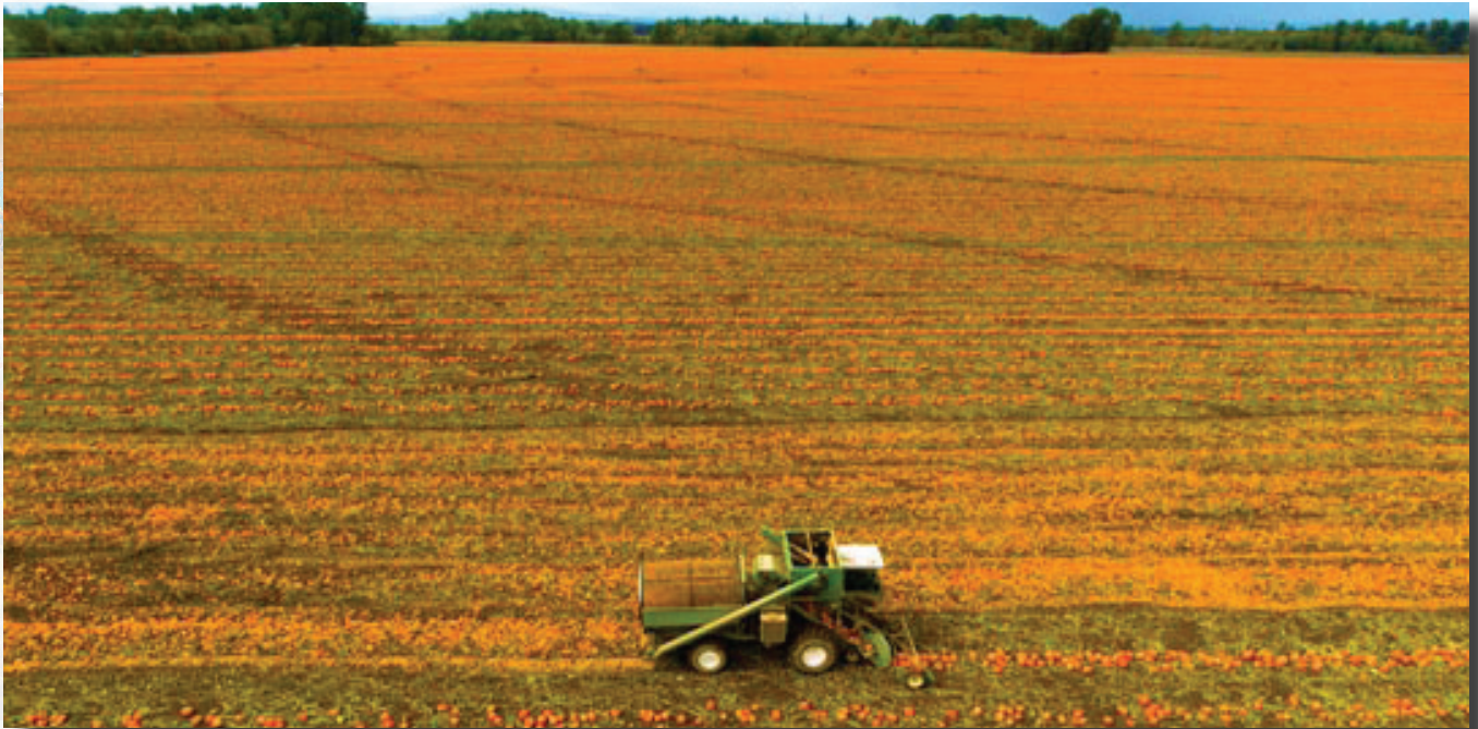
“Pumpkin Infinity” by Dave Horton