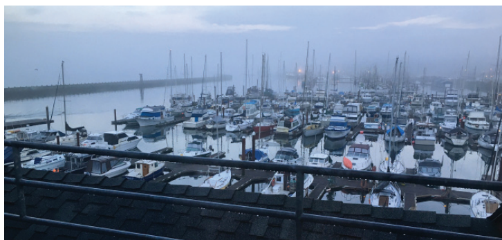
Newport, Every Morning

A perfect field trip for eighty shooters to ignore the weather and have fun doing it.