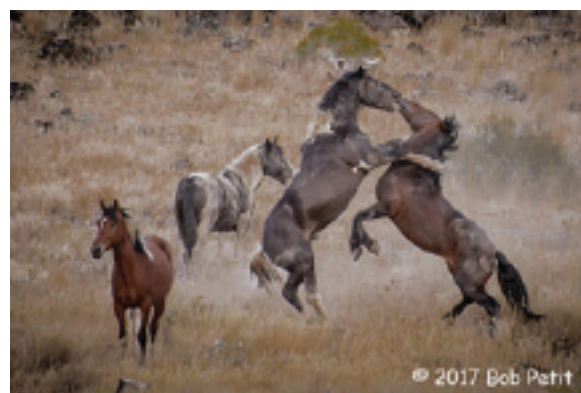
2nd-Place – Wildlife "Wild Horses Fighting" by Bob Petit