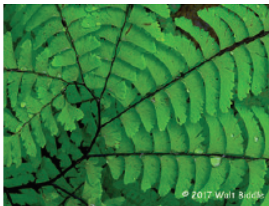
1st-Place – Peoples Choice, Plants "Maidenhair-Fern" Walt Biddle (The first metal print to be entered in this competition.)