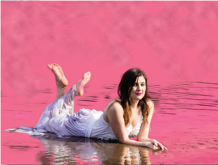
This shot was taken at last year's junk yard field trip. Really!

December – “small work - BIG TALENT,” Laguna, CA January 16 to February 22 – “WILL WOMEN 2018” at the River Gallery 184 So. Main St., Independence OR. April 6, 2018 – “CASCADIA” Crossroads Art Center Baker City. This show opens here, then the exhibit will travel to: May 2018* – The Dalles Public Library in and to July 2018 * – “Oregon State University,” Corvallis * Opening date TBA