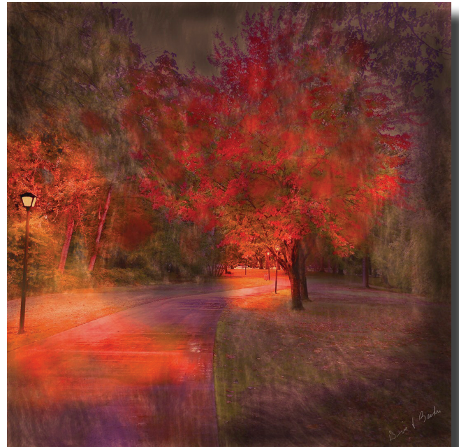
Shot with cell phone in daylight. Processed on an iPad.