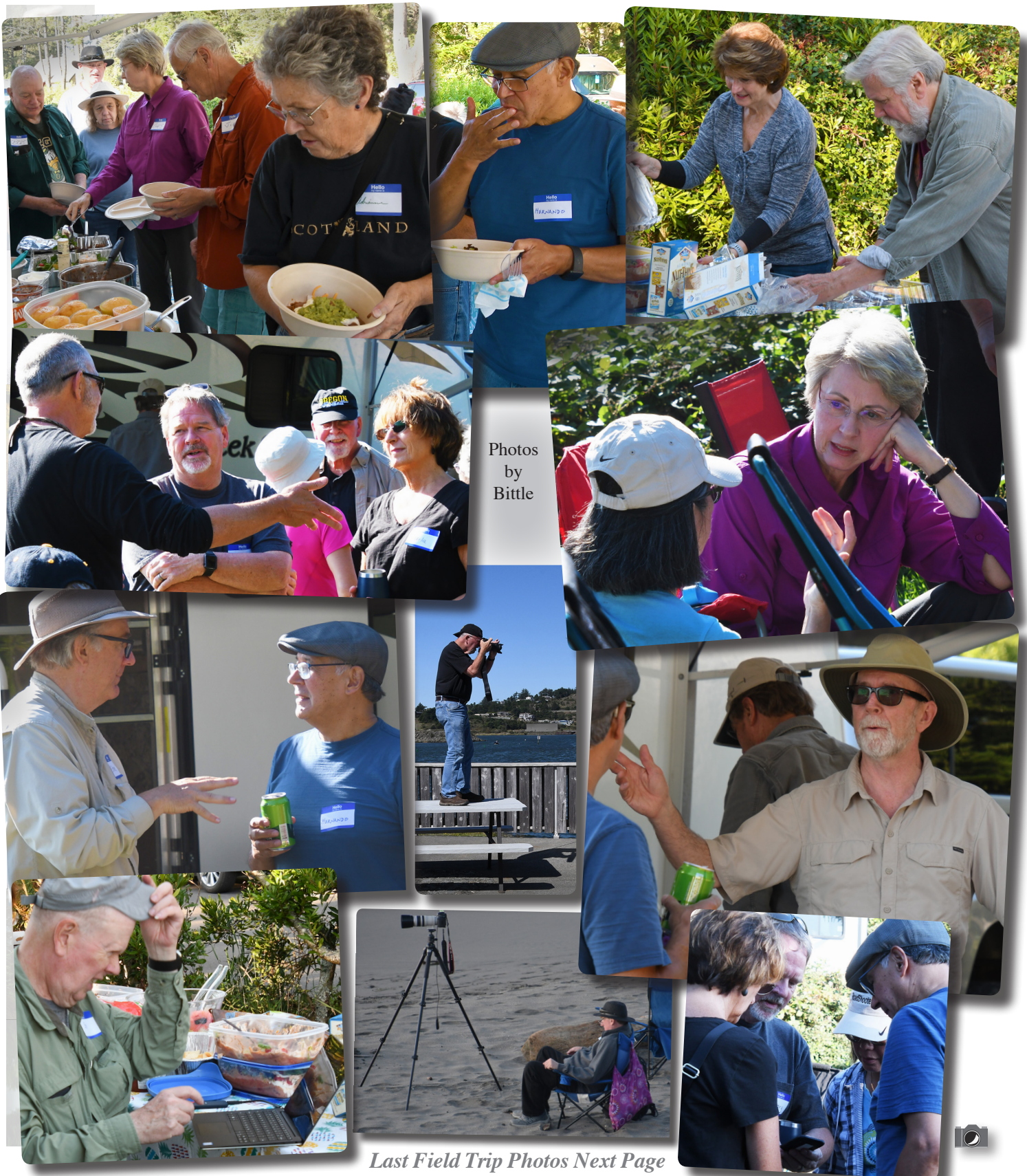
Last Field Trip Photos Next Page