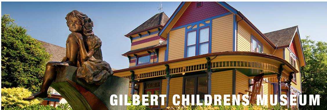
GILBERT CHILDRENS MUSEUM